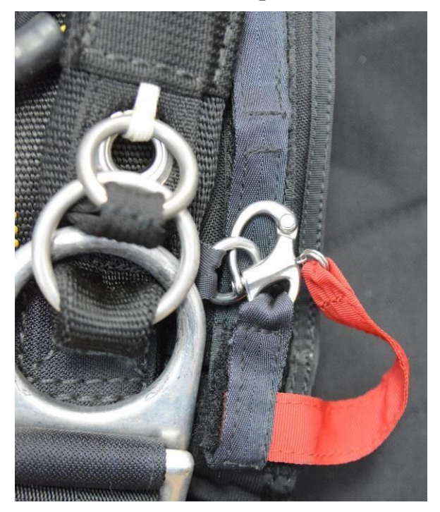
Figure no. 5