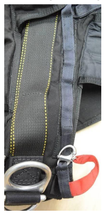
Figure no. 4

View of the AOZP-RAX cord glued to the right shoulder cup.