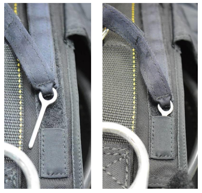
Figure no. 2, 3

Insertion of the needle into the hem tube on the shoulder cup of the parachute cover.