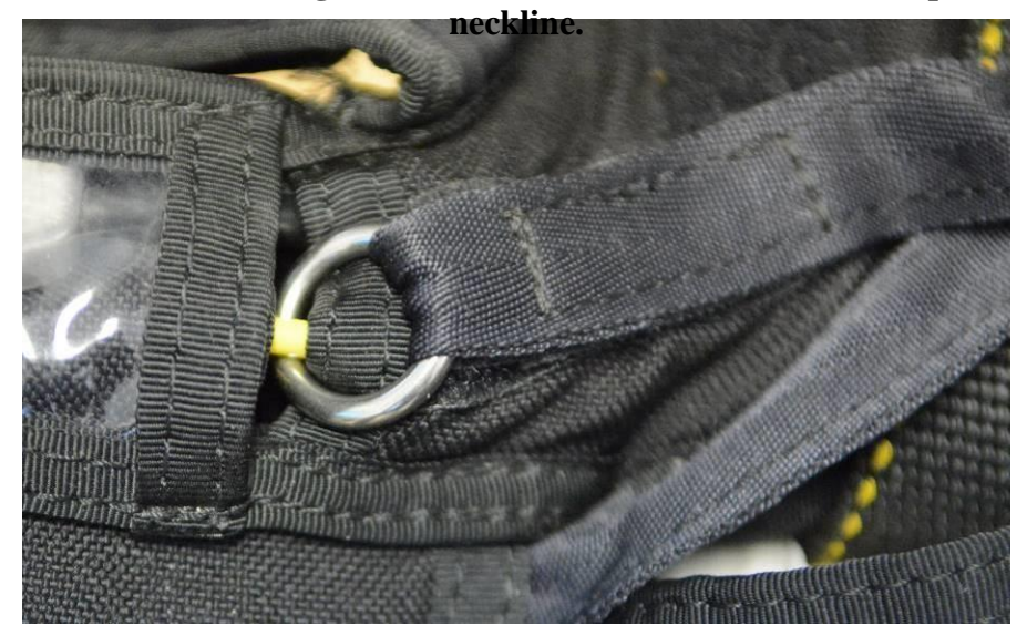
Connection of the ring between the divided hose ends at the top of the