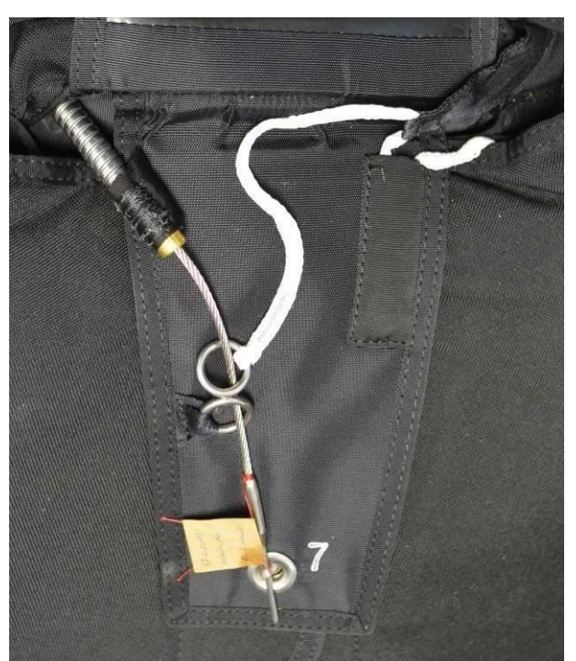
View of the correctly connected ring of the AOZP-RAX system and the closed and sealed parachute cover.

Figure no. 10 Notice: The cable of the reserve parachute ripcord including the needle must pass through the AOZP-RAX cord ring with 15 mm diameter and a spacer ring!