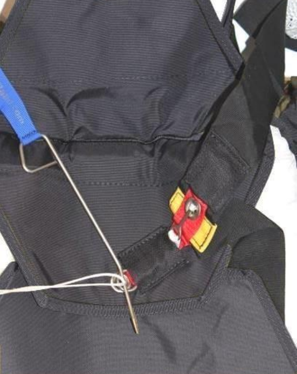
Figure no. 7

Connecting the RAX loop ring to valve No. 2 and securing it with an auxiliary wrapping needle.